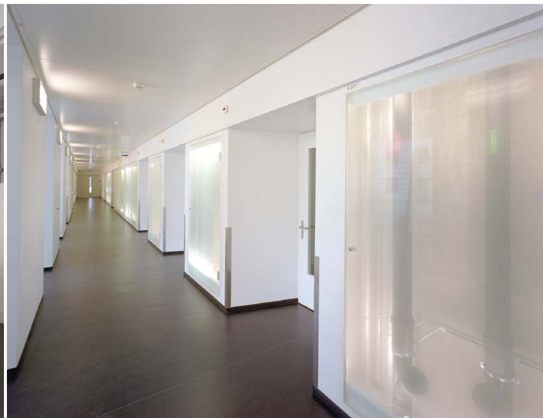
access zones with technical housing as art