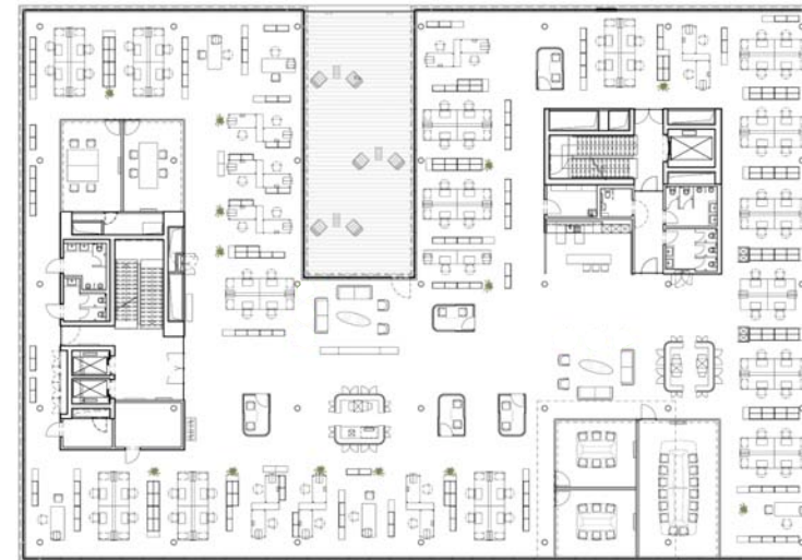
level 1 & 2 open-space offices