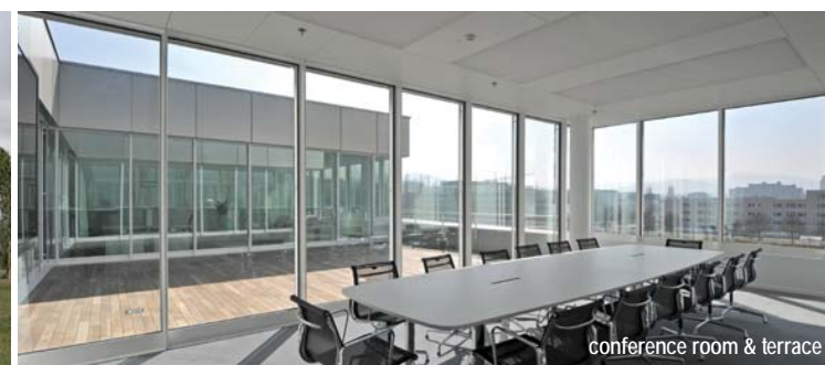
conference room & terrace