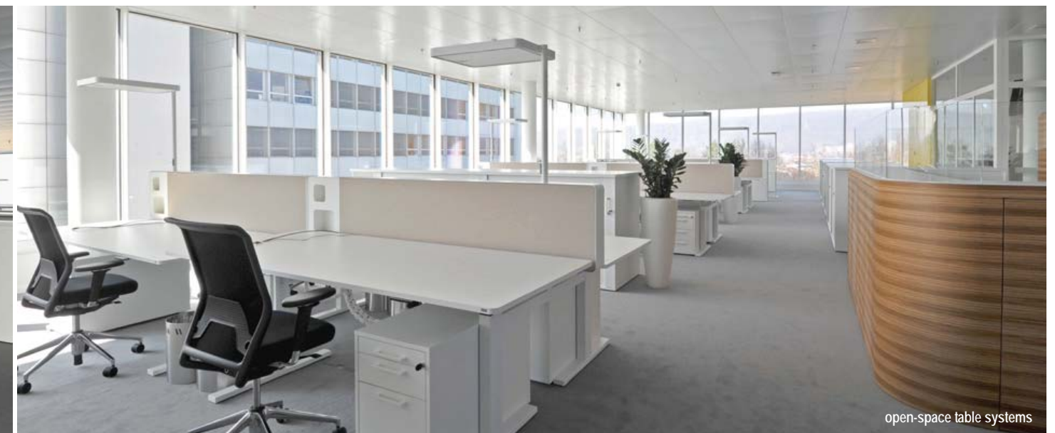
open-space table systems